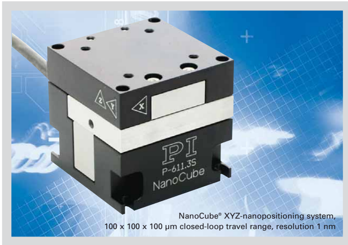
NanoCube® XYZ-nanopositioning system, 100 x 100 x 100 µm closed-loop travel range, resolution 1 nm