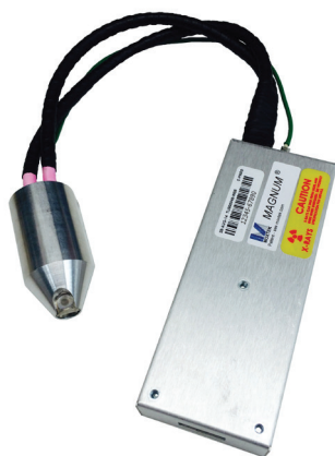
40kV MAGNUM® Reflection Source