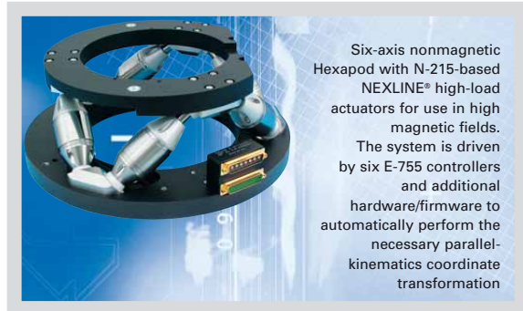
Six-axis nonmagnetic Hexapod with N-215-based NEXLINE® high-load actuators for use in high magnetic fields. The system is driven by six E-755 controllers and additional hardware/firmware to automatically perform the necessary parallel-kinematics coordinate transformation

0.001 % over the full travel range. The products described in this datasheet are in part protected by the following patents: German Patent No. 10148267 US Patent No. 6,800,984