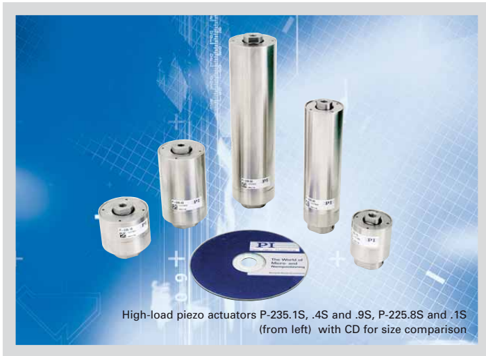
High-load piezo actuators P-235.1S, .4S and .9S, P-225.8S and .1S (from left) with CD for size comparison