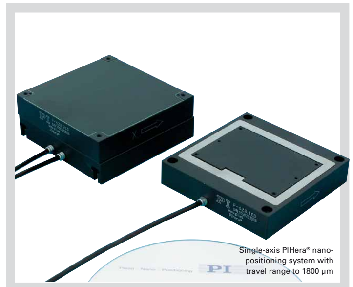
Single-axis PIHera® nanopositioning system with travel range to 1800 µm

Open-loop versions are available as P-62x.20L. Vacuum versions to 10 -3 hPa are available as P-62x.2UD.